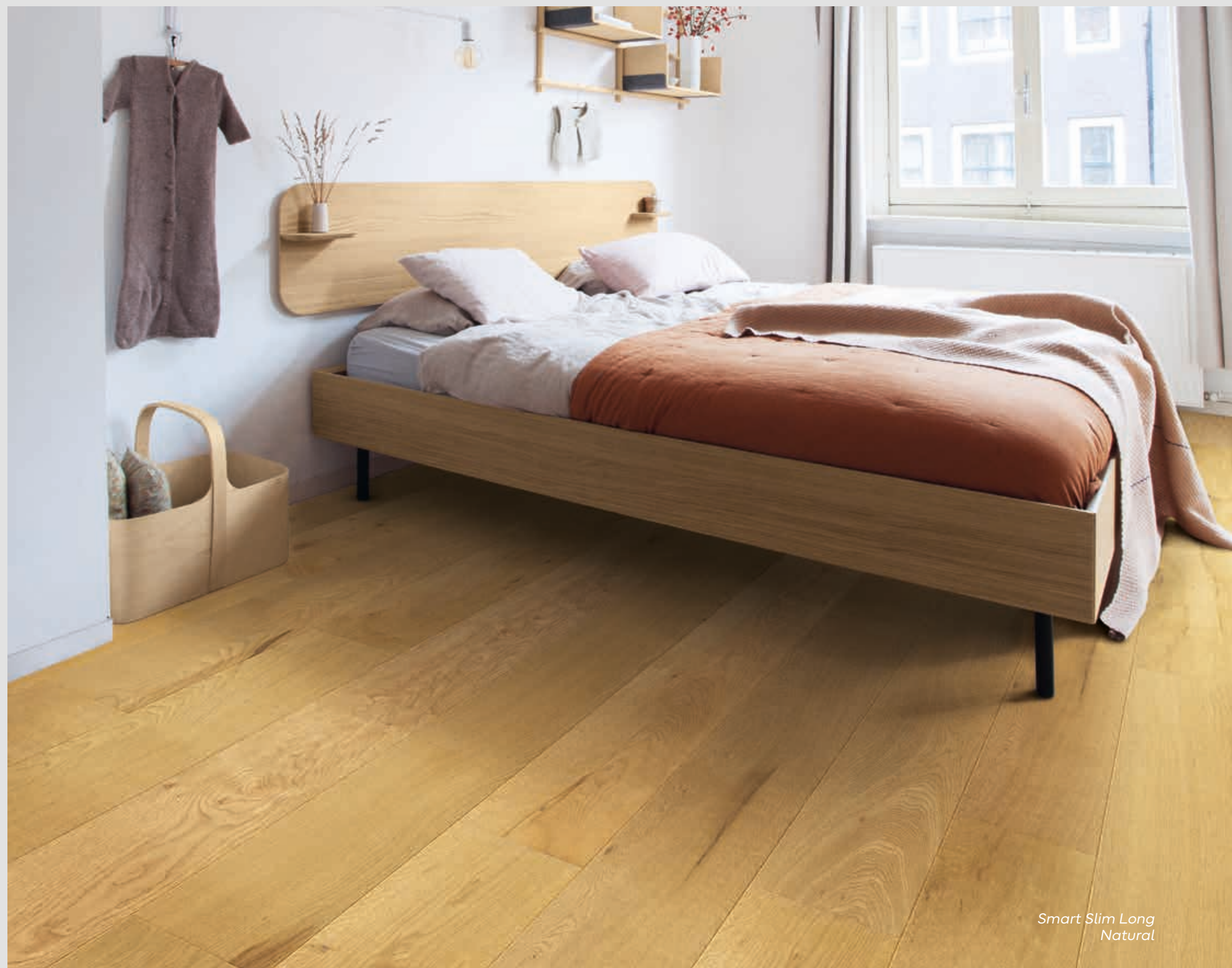
Smart Slim Long Natural