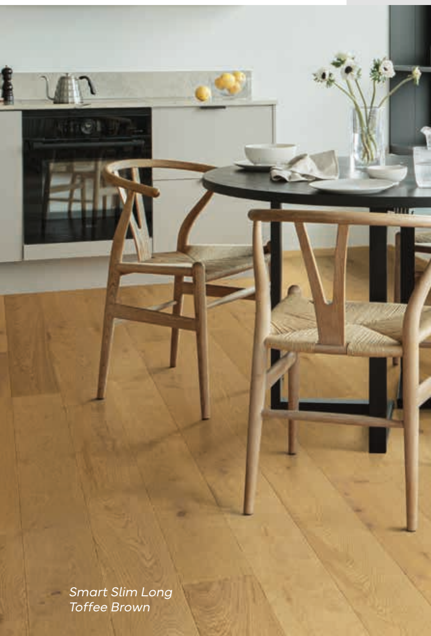
Smart Slim Long Toffee Brown