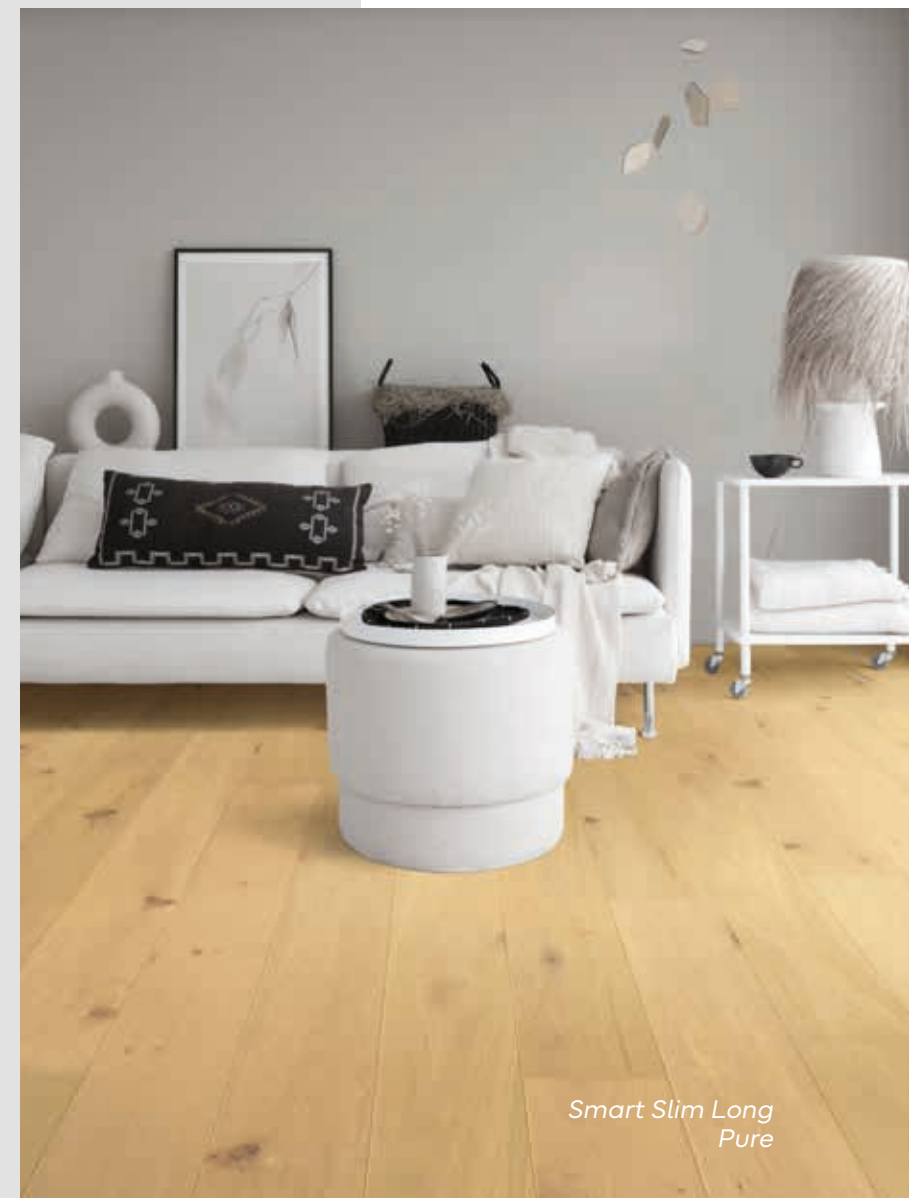
Smart Slim Long Pure

The new 10 mm collection by Unilin that dresses every room. The noble oak layer and the HDF core combine in one product all the elegance and natural beauty of wood with the stability and strength of a truly technological product.