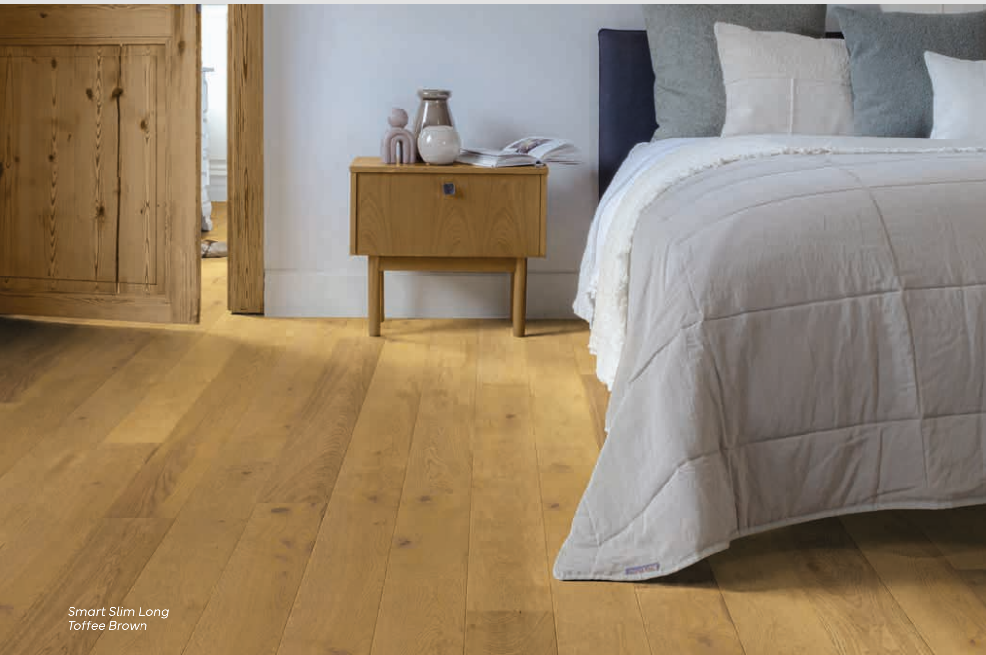
Smart Slim Long Toffee Brown